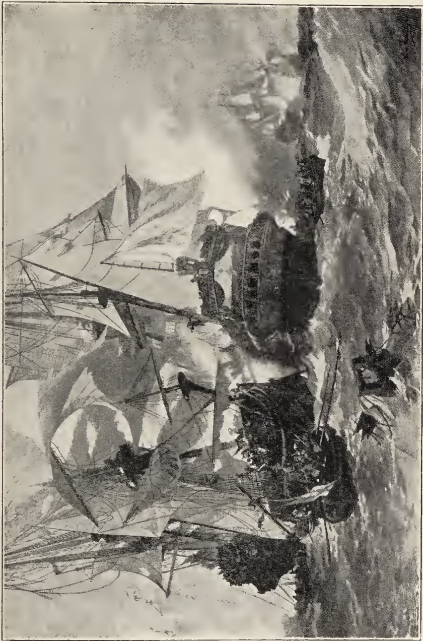
NAVAL ENGAGEMENT OPPOSITE ROMERSWAEI UNDER THE SPANISH ADMIRAL ROMERO AND THE SEA-BEGGAR "BOISOT."